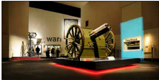
Imperial War Museum North