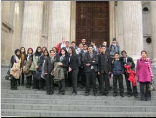
St Pauls Cathedral