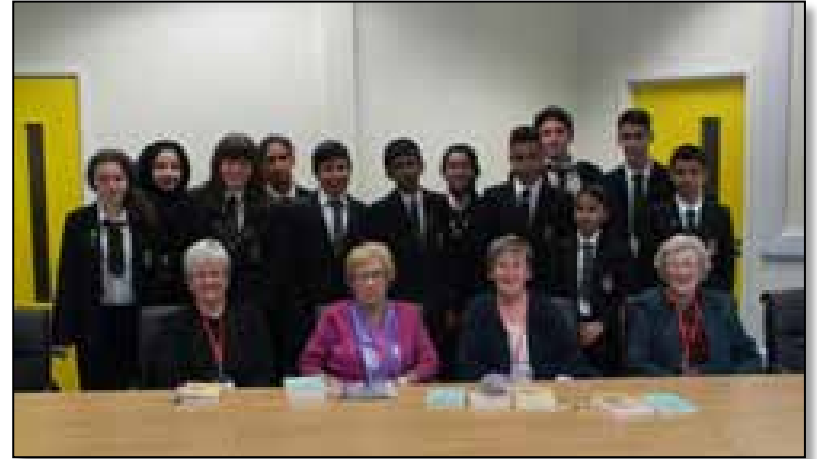
Holocaust survivor Eva Schloss