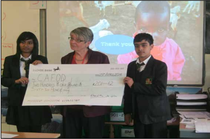
Raising awareness of and money for charities