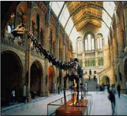
Natural history Museum