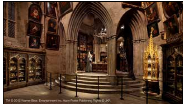
Harry Potter Studios London