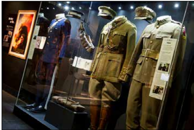
The National Army Museum came into school