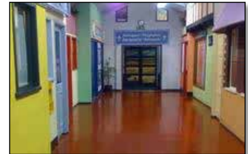
Europa Language Centre