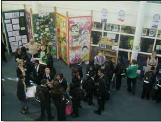
School clubs fair