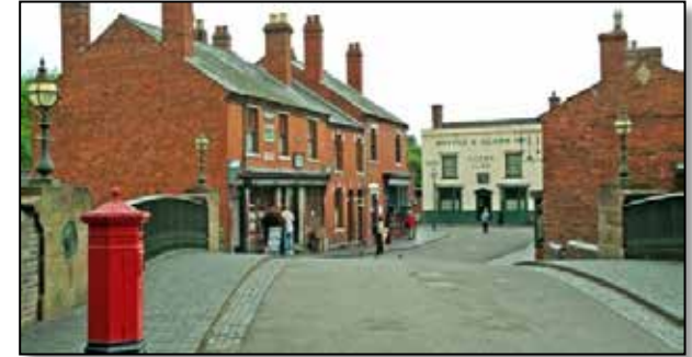
Black Country Living Museum