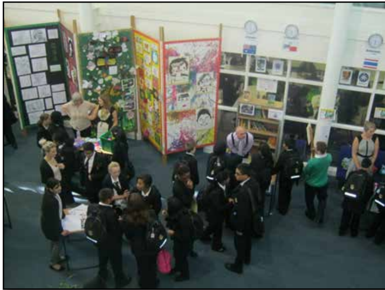
School clubs fair Natural High