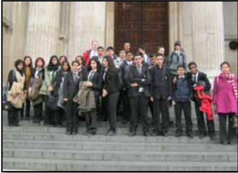
St Pauls Cathedral