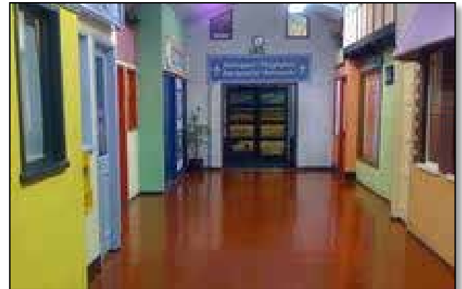
Europa Language Centre