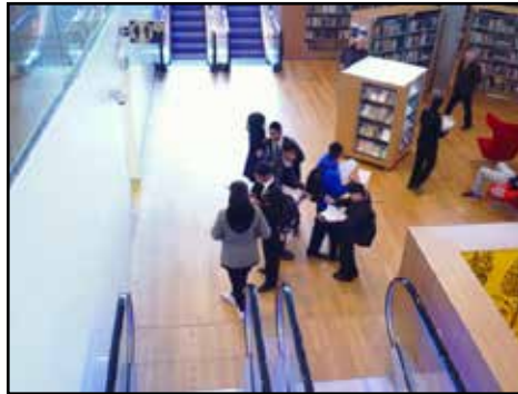
Birmingham Library , Museum & Art Gallery