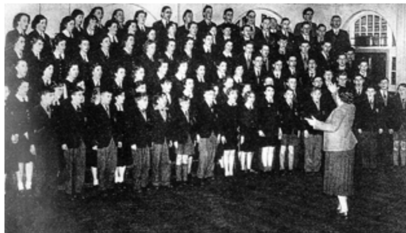
The 'House of Wisdom' Choir from the Yardleian 1954-1955