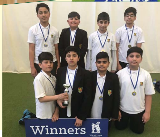
Pictured right (top) some of our Girls' Badminton team, Year 9 Cricket team, and (below) our Year 7 Cricket team