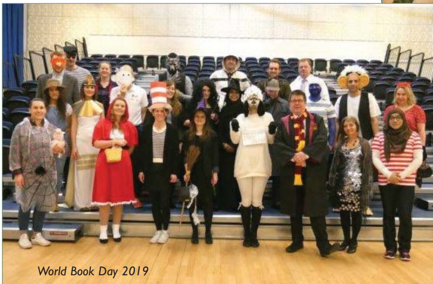
World Book Day 2019

Pupils are being encouraged to engage closely with university level critical essays to help them to develop both their understanding of texts, the way in which they interrogate what they read and relate texts to the real world of today. Finally all pupils are being supported by ensuring that written pieces of work have a clear focus which helps prevent pupils from being overwhelmed by too many areas to improve.